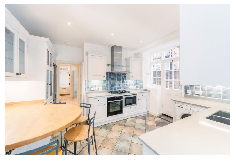
JUBILEE PLACE SW3

*Please note fees may be applicable to potential tenants. Please ask us for more details.